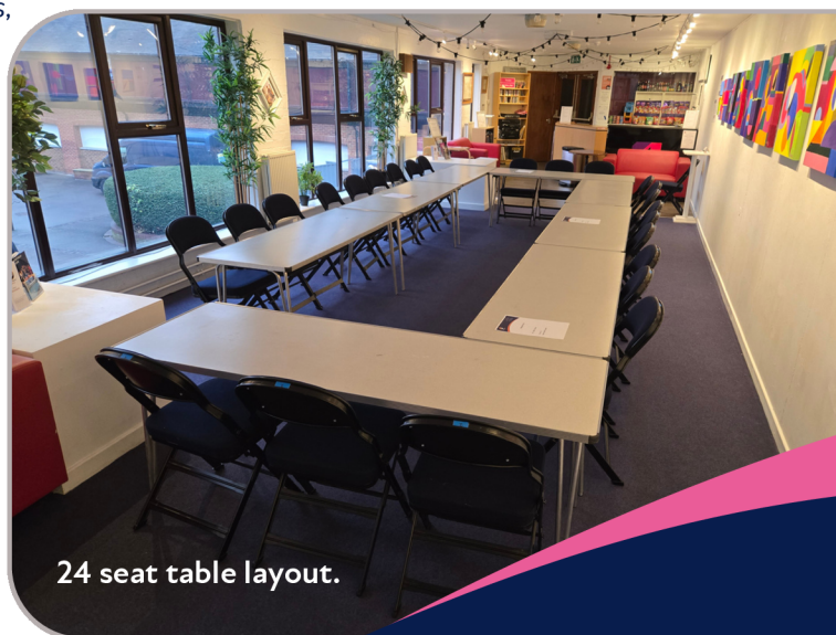
24 seat table layout.

For more information, charges and if you would like to organise a tour of the space, please contact: theatre@stantonbury.tove.org.uk